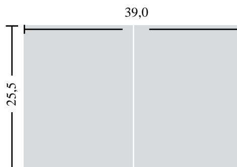
Double (cm 39x25,5)

An abundance of cm 0.5 per side is required on all formats. Materials provided in pdf format closed and ready to print.